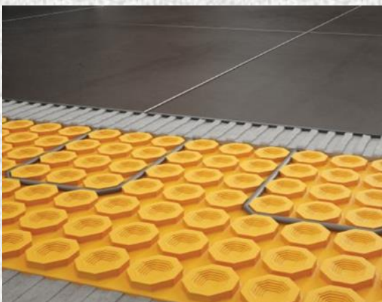
Floor Warming & DITRA-HEAT