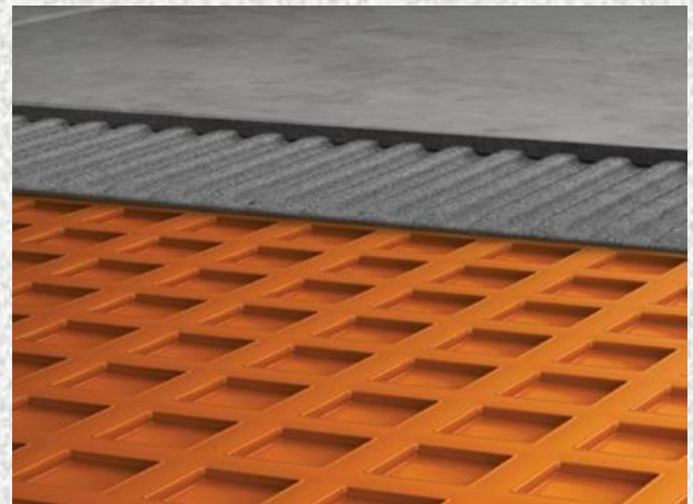
The Uncoupling Principle & DITRA