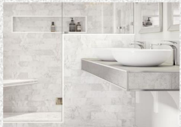
Tile Edge Protection & Finishing with Profiles